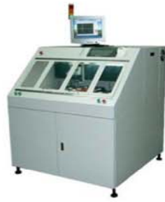
Router R2200 2x table with options to merge to 1x big table