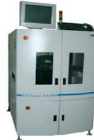
Laser Marker LS2000 Barcodes, 2D, logos, graphics ...