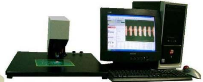
Solder Paste Height Checker