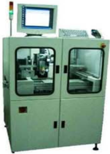
Precision Dispenser with fiducial ref & nozzle tip calibration