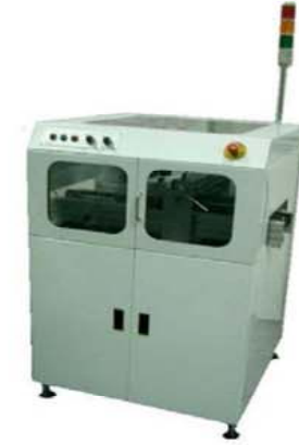
New! PCB Brushing System