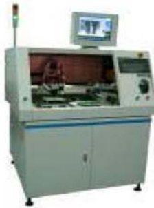
Router R2500 meets your budget without sacrificing performance