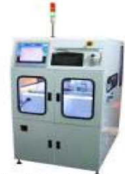
In-Line labeler LB1000 Pick n place printed labels onto PCBA or modules