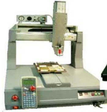
Programmable Bench Top Epoxy Dispenser