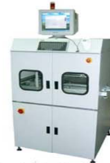
In-Line InkJet Marker MK1200