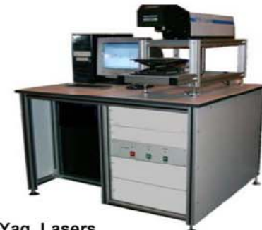
Range ND Yag Lasers