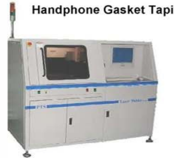
Programmable X-Y table Laser Marker