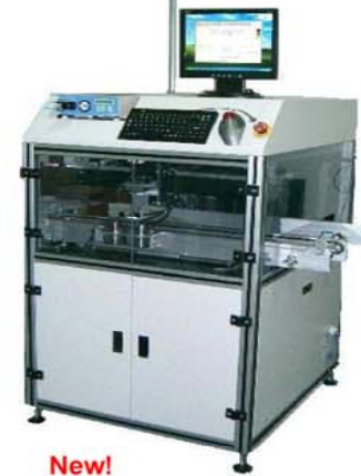
New! Conformal Coating System