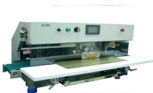
V-Groove Depaneliser Straight Cut with conveyor and safety cover