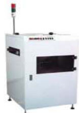
Bareboard Loader BBL2000