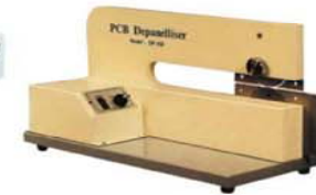
V Groove Depaneliser DP 108