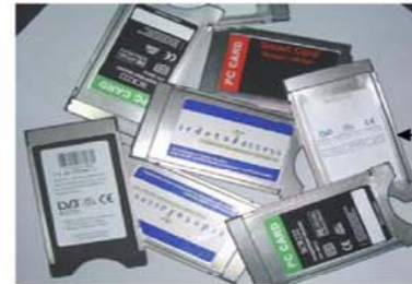
In-Line Labelling on Modules