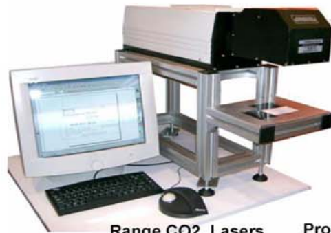
Range CO2 Lasers