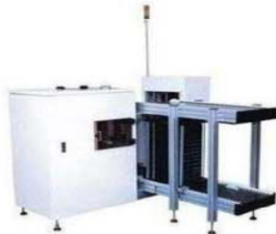
BareBoard/Mag Loader (2 in 1) Model: MBL2008