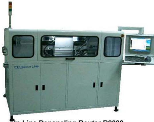
In-Line Depaneling Router R2300